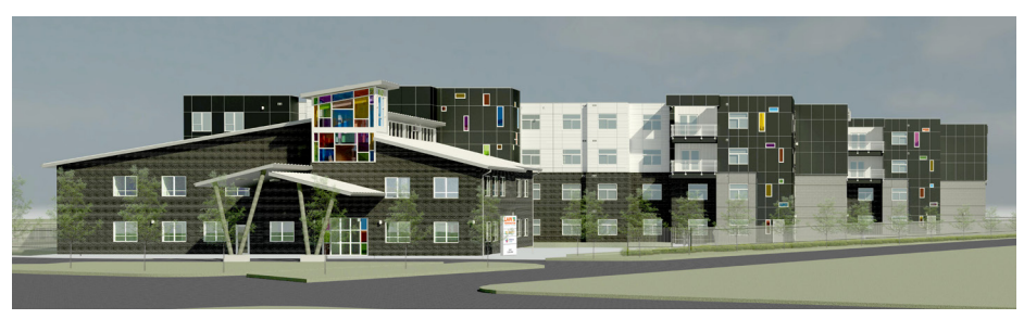
Rendering of the Law Harrington Senior Living Center

This is a major day in the City of Houston. There is no better testament to community investment than to ensure the vibrancy of seniors in our community.